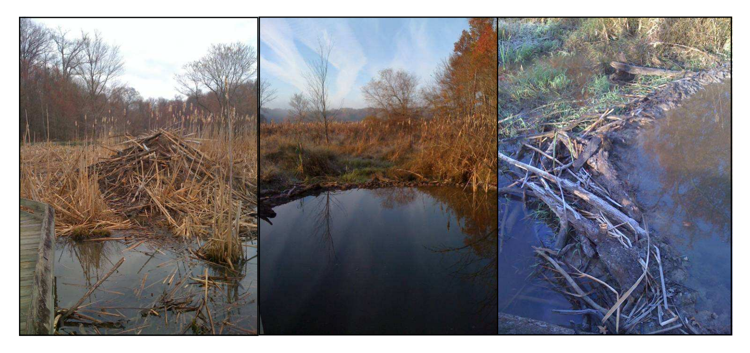
The beavers have been quite busy at Huntley this fall. Water levels at the start of the boardwalk have been raised by the new dam work. And their lodge seems to grow higher each week. Come out to see all the construction!